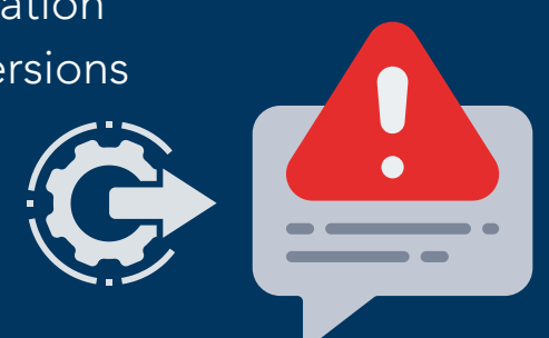
Errors and Warnings